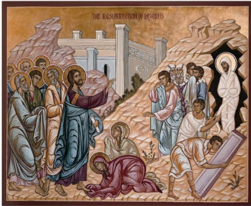
Raising of St. Lazarus (after Four Days in the Tomb) سبت العازر